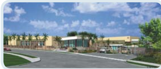
Bioprocess Training & Development Complex MAYAGÜEZ, PUERTO RICO

"From the start, PRTEC has worked to understand the needs of the project and has managed continuously and consistently to meet and exceed our requirements."